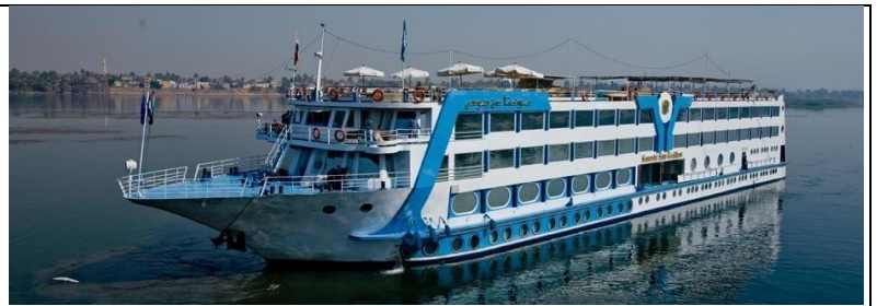
Our Home for Days Aswan to Luxor