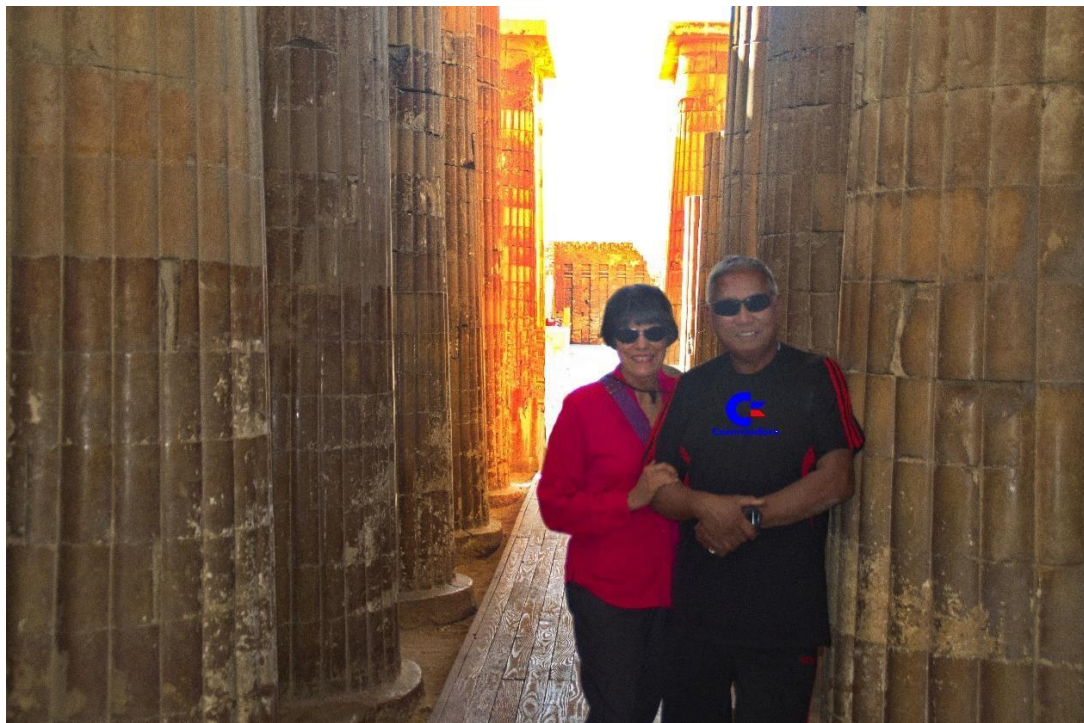
Entrance to the Pyramid @ Zoser