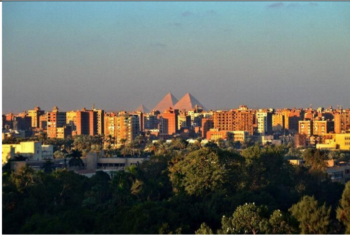
1 View of Giza from our Room